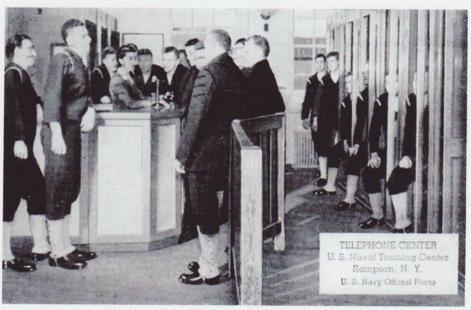
Telephone Center - US Naval Training Station Sampson

lives that the old-time country store did in the lives of rural folk of a bygone era, for here we gather to discuss events of the day, bowl a few strings, play the "Juke Box" and, at times, jive with one another."