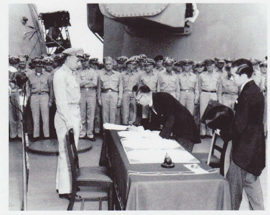
(Japan signs surrender documents- Sept. 1945)

1945 - Japan signs surrender documents on board USS Missouri (BB-63) at anchor in Tokyo Bay. FADM Chester W. Nimitz, USN, signs for the U.S. In different ceremonies.